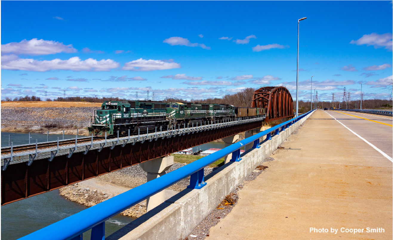
2nd Place winner of the West Kentucky Chapter of the NRHS March 2023 Photo Contest - PAL 3812 heads across the Tennessee River at Grand Rivers, Kentucky as it leads a coal train to West Paducah.