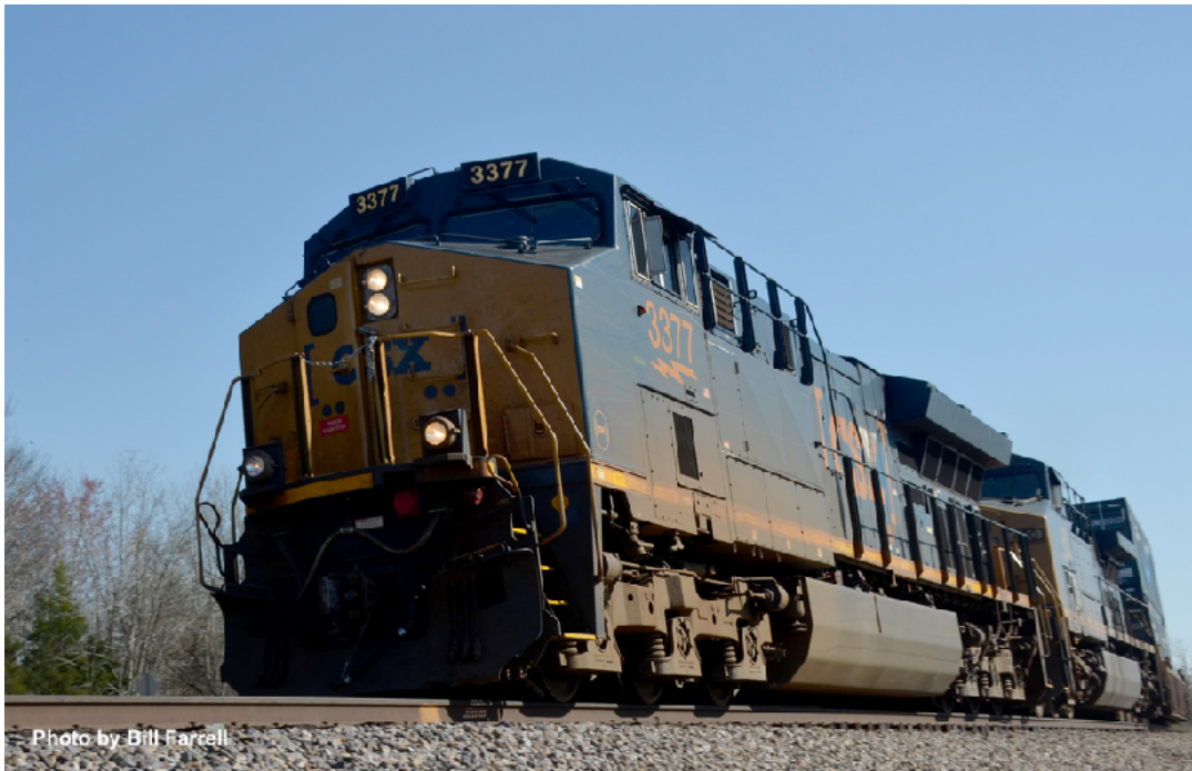
3rd Place winner of the West Kentucky Chapter of the NRHS March 2023 Photo Contest - CSX locomotive 3377 on the lead of train I025 at the north end of Kelly, Kentucky.